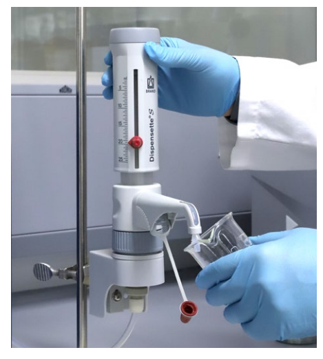
Dispensette<sup>®</sup> S connected with a barrel to a pipeline

The Dispensette<sup>®</sup> drum extraction system provides a solution in this situation. The Dispensette<sup>®</sup> can be attached to a laboratory rod or a metal stand, or fixed directly to a wall or laboratory furniture with screws. These options secure the Dispensette<sup>®</sup> in place and saves space. The media container can be placed in a base cabinet or on the ground nearby. Media is transported via fluoropolymer tubing. Changing containers is facilitated by a coupling element with ball valve, which ensures that the medium cannot leak from the fluoropolymer tubing.