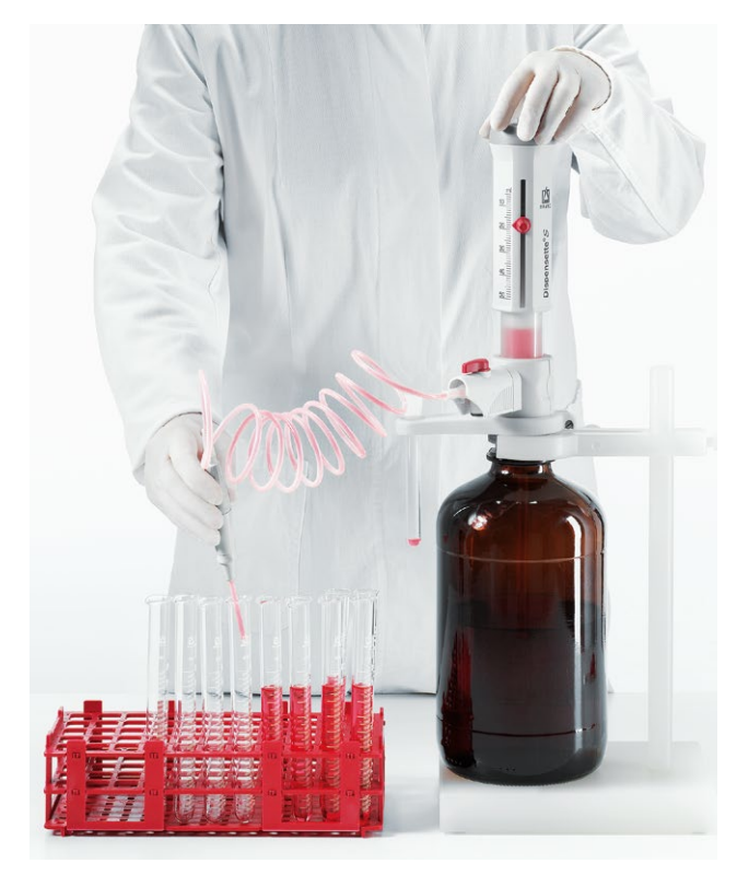
Work efficiently with flexible discharge tubing

When dispensing media with bottle-top dispensers, the sample cup is usually moved into position at the tip of the discharge cannula. In the case of small-volume sample containers, such as test tubes or cuvettes, which are placed in stands for better handling, it is advisable to do the opposite. This is where flexible discharge tubing comes in handy, as it can be moved to the sample container.