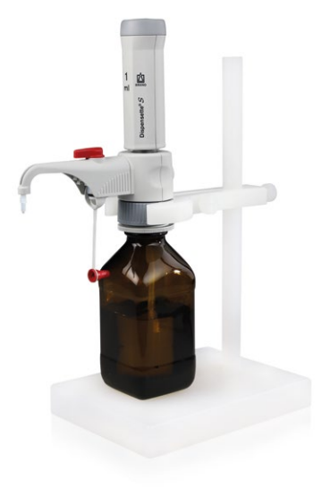
Bottle stand to protect against tipping

It is always good practice to secure bottle-top instruments such as the Dispensette<sup>®</sup>, seripettor<sup>®</sup>, and Titrette<sup>®</sup> from falling over, especially when small or light bottles are being used. The existing metal laboratory rods that are fixed to the wall or furniture in many laboratories can be used to secure the bottle-top instrument in addition to sleeves and clamps. However, this solution is quite inflexible and quick repositioning of instruments requires a bit of practice – especially if clamps are not yet installed at the new position. The bottle stand from BRAND assists you with quick location changes. Instruments are securely connected to a base plate via a stand with clamp. The center of gravity is shifted downwards by the weight of the bottle holder and the base plate increases the standing surface.